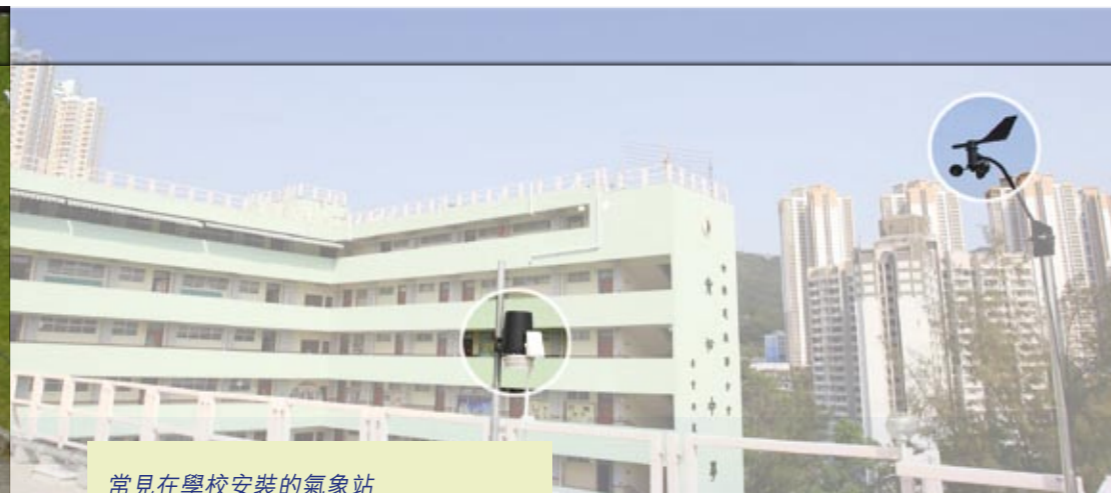
常見在學校安裝的氣象站 A typical AWS installed at school

Co-WIN 網站展示各自動氣象站量度的溫度、雨量等天氣數據，部份更含太陽輻射及紫外線指數等資料。