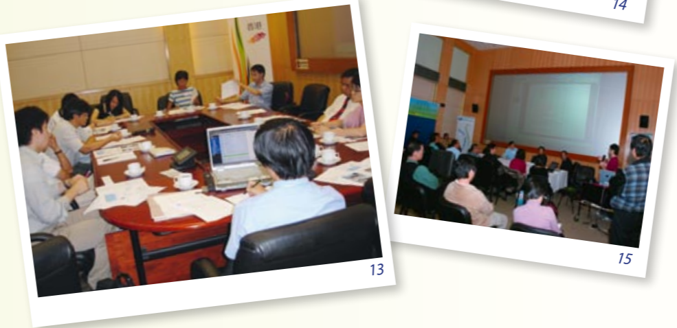
12 14 學生分享利用Co-WIN進行科技研究的經驗 Students sharing their experience in using Co-WIN to carry out scientific and technological studies 13 15 老師分享經驗 Teachers sharing their experience