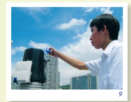
7 8 學生在指導下記錄及分析氣象數據 Students record and analyse weather data under guidance 9 學生進行紫外線實驗 Student carrying out experiments on ultra-violet radiation 10 11 學生利用便攜式氣象儀器進行熱島效應研究 Students conducting urban heat island study using portable weather instruments